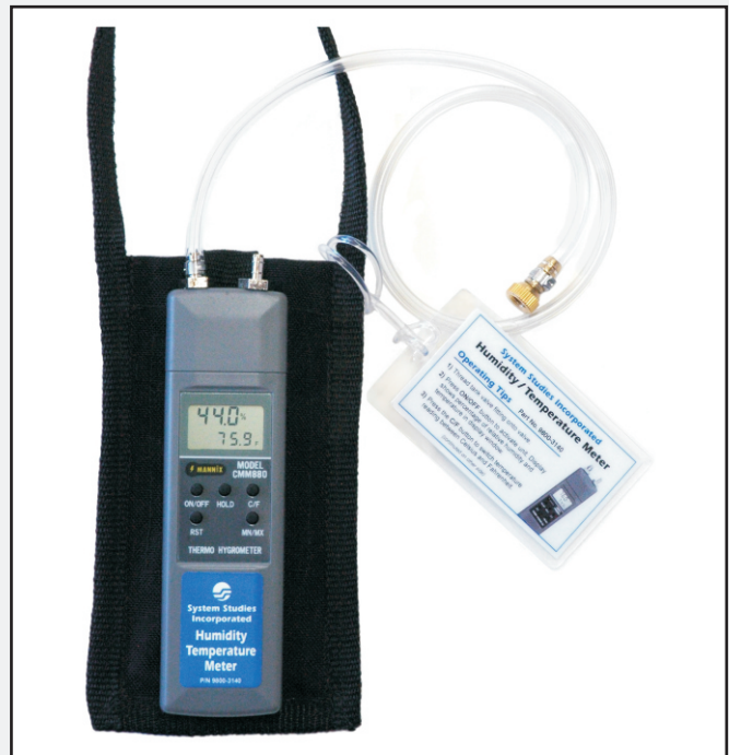
Part No. 9800-3140