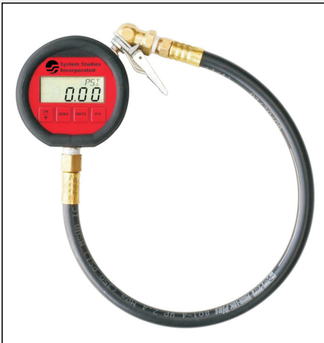
Part No. 9800-3123

To find out more about how you can best keep your air dryers in good operating condition, please contact the System Studies Field Engineer in your area.