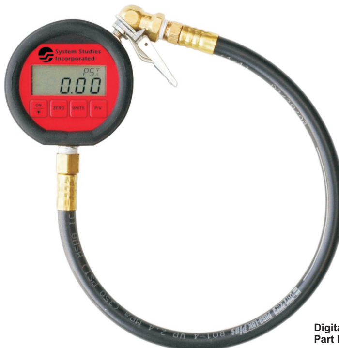
Digital Pressure Gauge Part No. 9800-3123

Note: The Digital Pressure Gauge Operation Instruction comes attached to gauge.