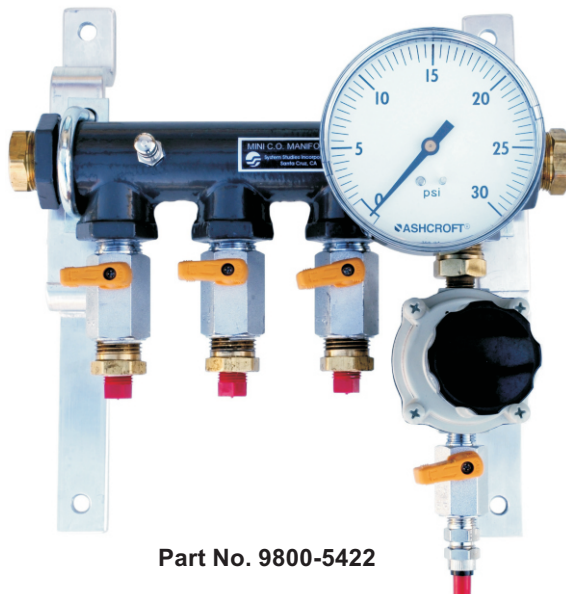
Part No. 9800-5422