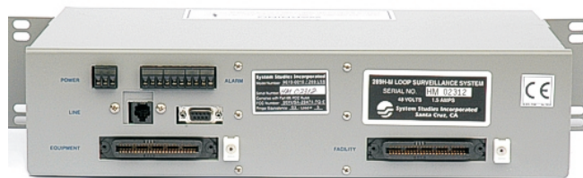
The words 289H Loop Surveillance System(LSS), 289H-M LSS, and PressureMAP are trademarks of System Studies Incorporated.