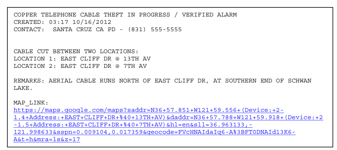
SCREEN 1: SAMPLE ALARM